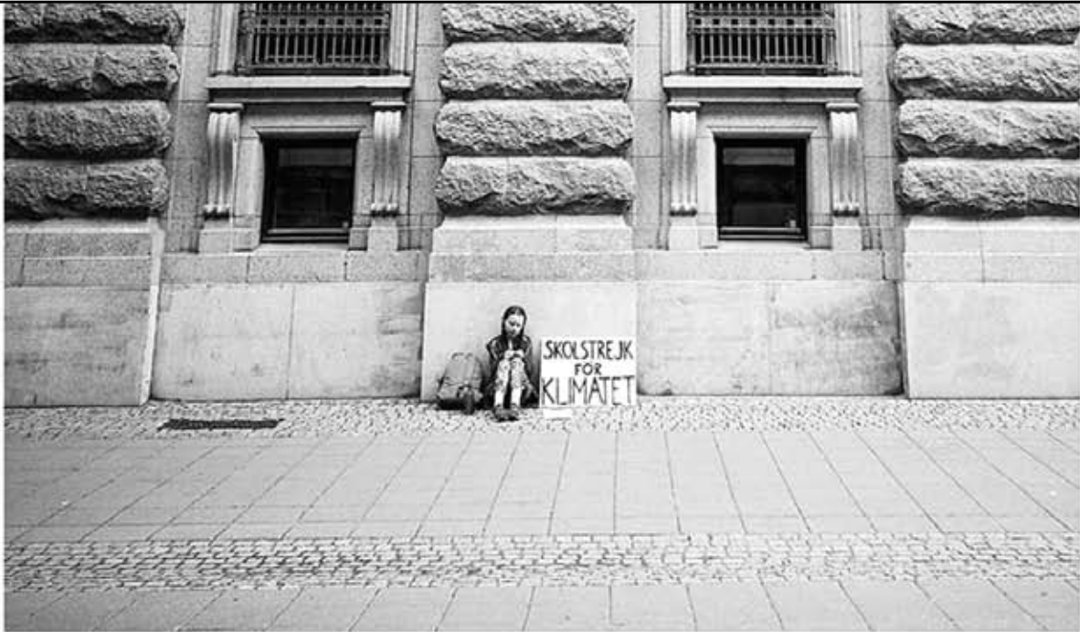
Greta Thunberg starts her "Friday Strike For The Climate", Stockholm, August, 2018