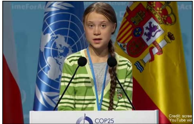
COP25

Greta Thunberg speaks: "The biggest danger is not inaction. The real danger is when politicians and CEOs are making it look like real action is happening when in fact almost nothing is being done apart from clever accounting and creative PR."