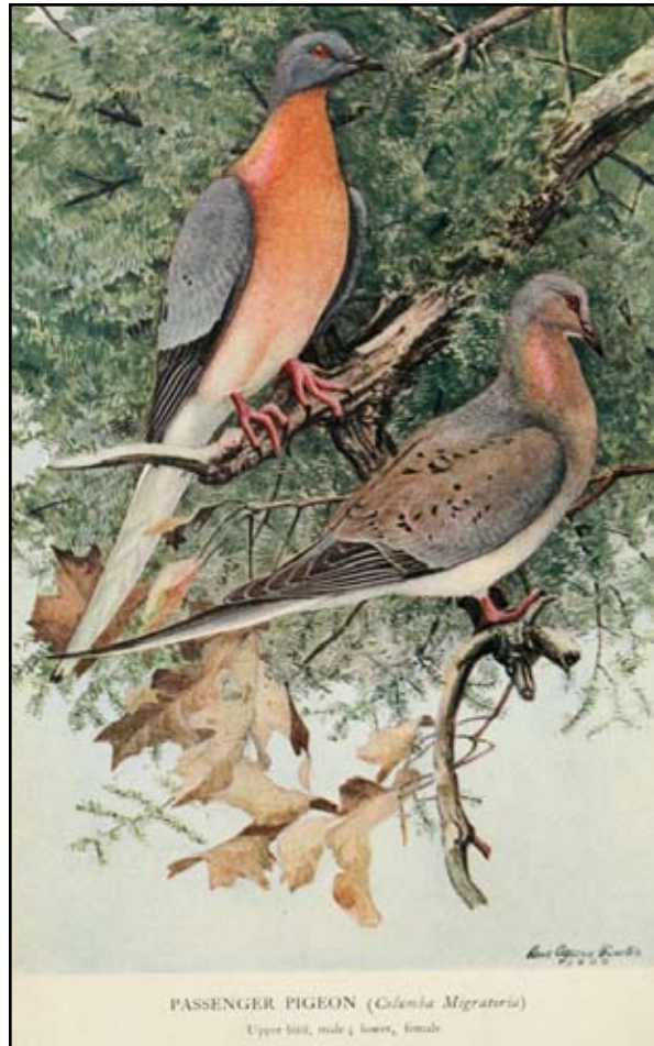
Frontispiece from a volume of articles, The Passenger Pigeon , Print date 1907 (Mershon, editor) Passenger Pigeon (Columba Migratoria) Upper bird, male; lower, female.

Because they did not exist during the first five mass extinction events on Earth, birds have been spared the widespread