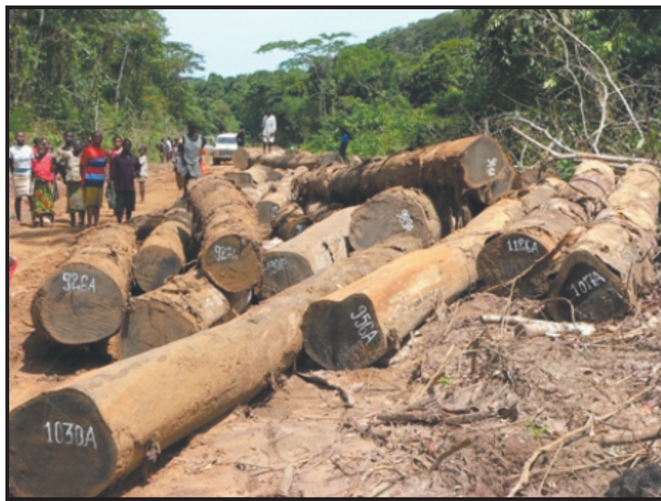
To date, forest peoples have been left out of the United Nations discussions about how protecting rainforests can help prevent catastrophic climate change and this is what happens when they don't have a voice.