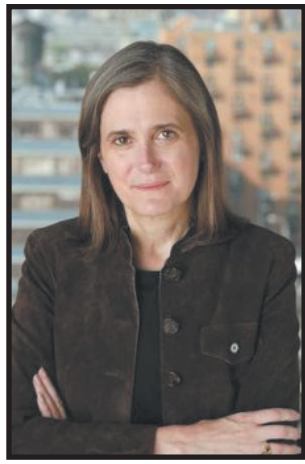
Amy Goodman of Democracy Now! won an 'Alternative Nobel' for her work to promote peace, social justice and independent reporting.