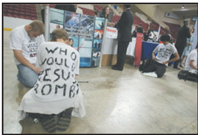
Members of the Global Justice Project knelt in front of the Raytheon table at the career fair.