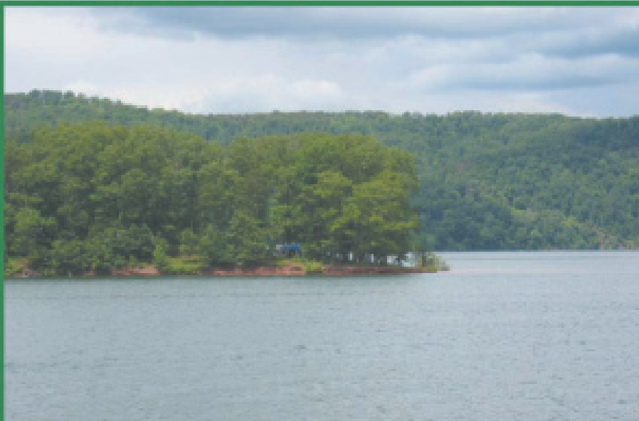
Raystown Lake: An 8,000-Acre Lake in Central Pennsylvania

19 Key Vulnerabilities can be identified based on a number of criteria in the literature, including magnitude, timing, persistence/reversibility, the potential for adaptation, distributional aspects, likelihood and 'importance' of the impacts.