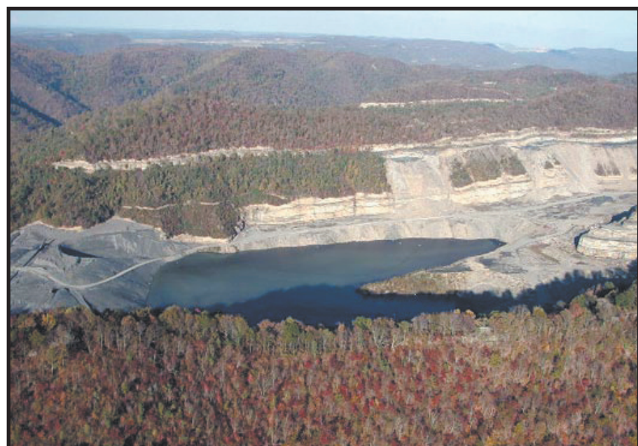
Here is the correct photo for last month's article by Cynthia S. Waugh, "What's Happening to The Mountain State?" Sludge Pond at Mountaintop Removal Site: These artificial ponds are filled with a toxic sludge that is a safety worry because these impoundments leak and break, especially during heavy rain. West Virginians remember the 2000 Kentucky impoundment failure "... what federal officials called the worst environmental disaster in southeast U.S. history ... ." (www.loe.org). Families near MTR sites continue to find contaminants in their drinking water: arsenic, manganese, lead, barium, selenium, aluminum (www.pbs.org), and the list continues to grow.