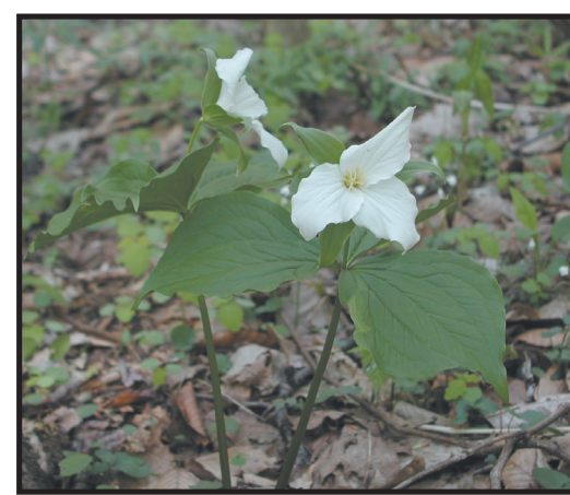
This is a white variety of Trillium. There are also black (which looks deep burgundy) and red. You can see the fuzzy center, which gets a bit more feather-like after petals fall. A trillium heart is what is left of the flower when the petals have all fallen off. It looks like a feathery small heart.