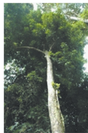
Isn't THIS how trees are supposed to look?

Forest destruction releases more CO 2 each year than all the cars on the planet. Healthy forests absorb and store vast quantities of carbon, helping to regulate temperature and generate rain. Quite simply, if we lose rainforests, we lose the fight against climate change. Rainforests are home to millions of people around the world; we can't save the forests without them. As RFUK's experience over the past 20 years has shown, one of the best